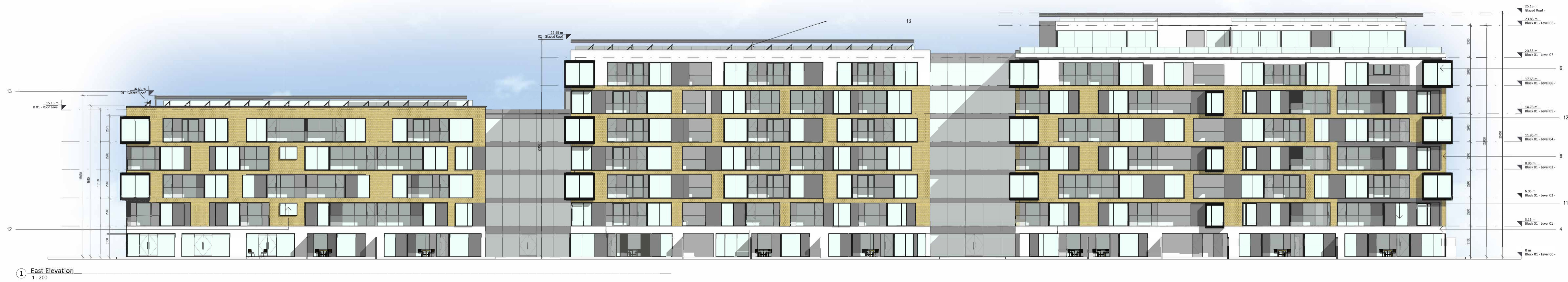
1 East Elevation 1:200