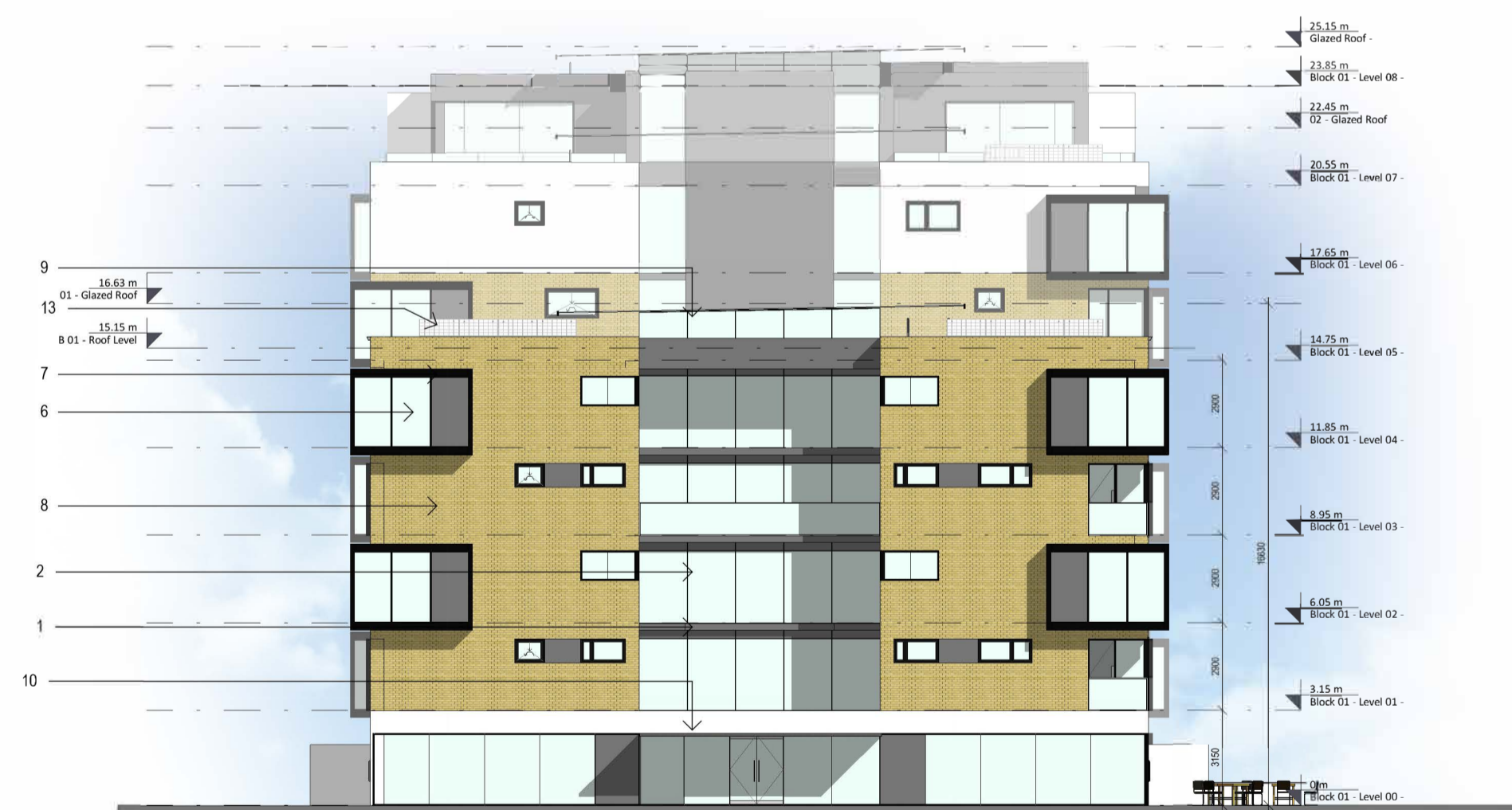
4 South Elevation 1:200