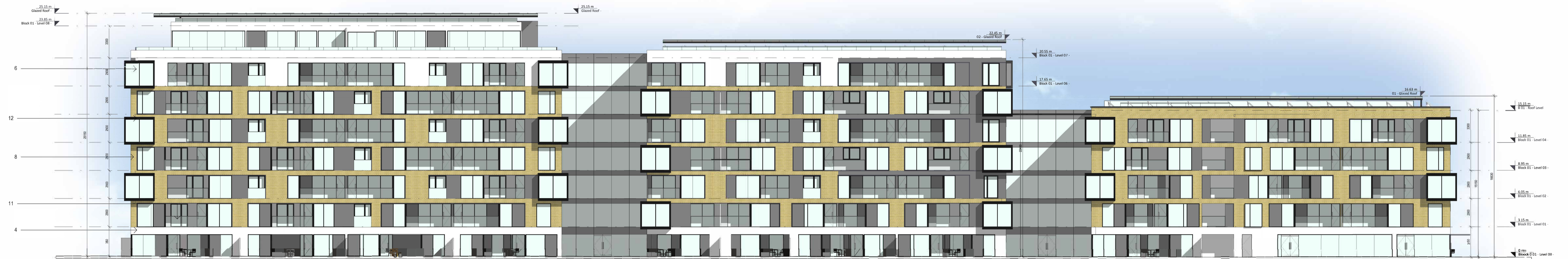
2 West Elevation 1:200