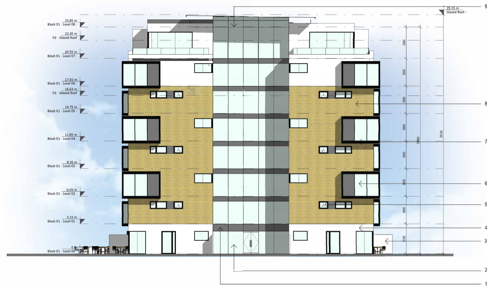
3 North Elevation 1:200